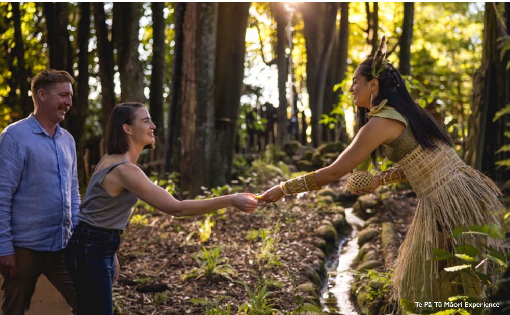
Te Pā Tū Māori Experience