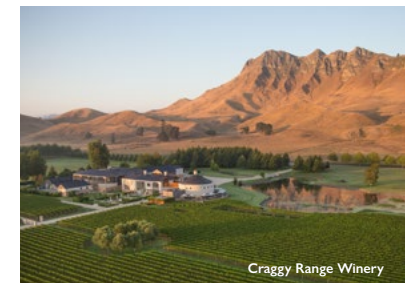
Craggy Range Winery