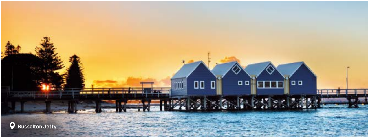
📍 Busselton Jetty