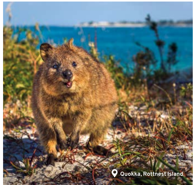
📍 Quokka, Rottnest Island