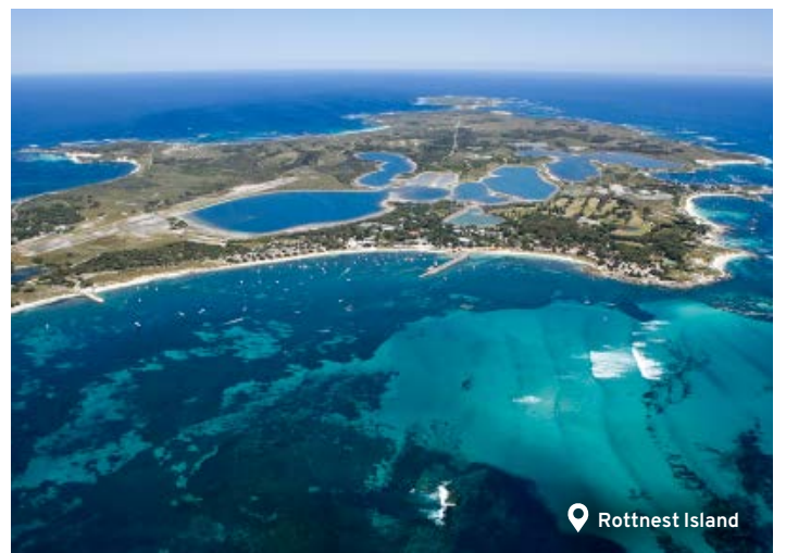
📍 Rottneest Island