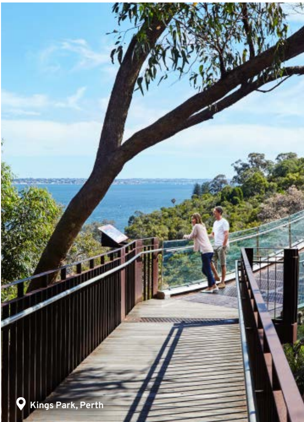
📍 Kings Park, Perth