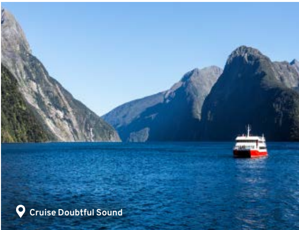
📍 Cruise Doubtful Sound