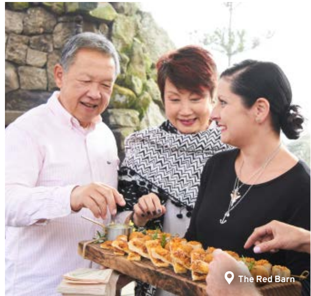
📍 The Red Barn