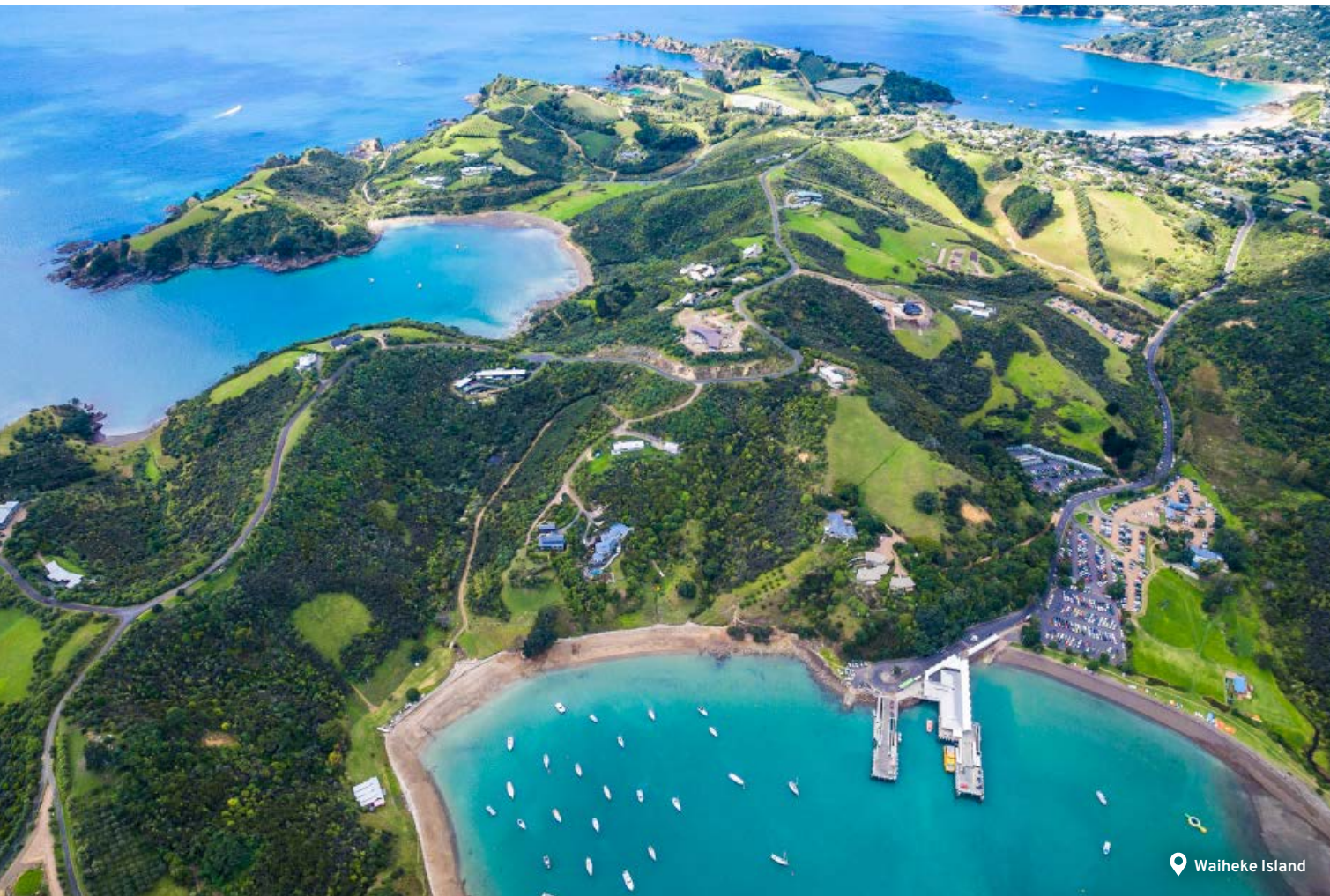
📍 Waiheke Island