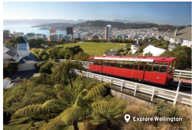
📍 Explore Wellington