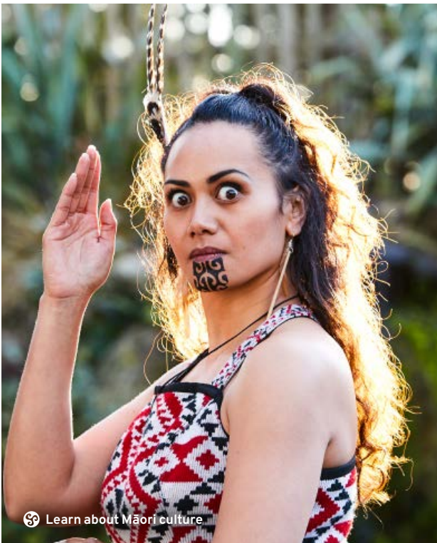
📍 Learn about Māori culture