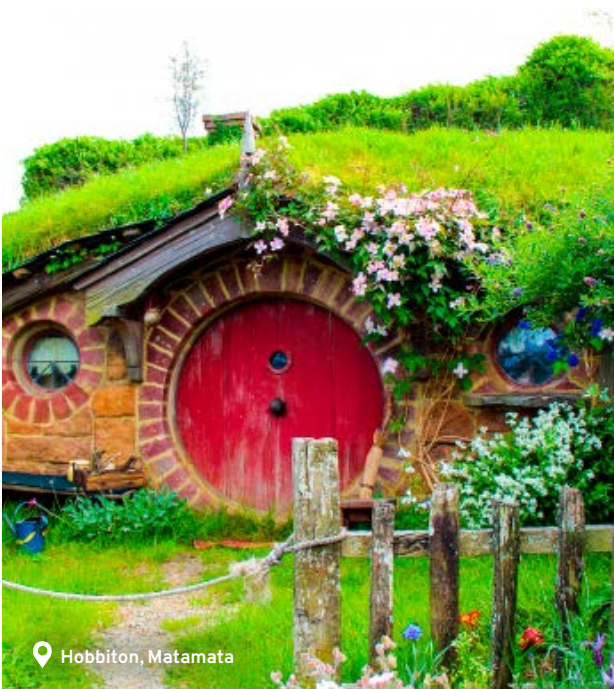
📍 Hobbiton, Matamata

10 DAYS Auckland • Rotorua • Wellington • Waiheke Island • Queenstown • Doubtful Sound