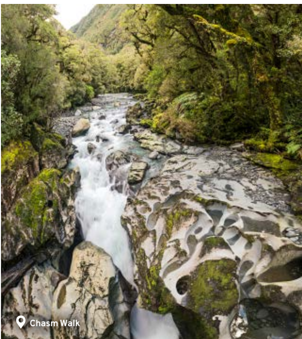
📍 Chasm Walk

12 DAYS Christchurch • Arthur's Pass • Franz Josef Glacier • Queenstown • Milford Sound • Te Anau • Dunedin • Pukaki • Tekapo • Church of the Good Shepherd