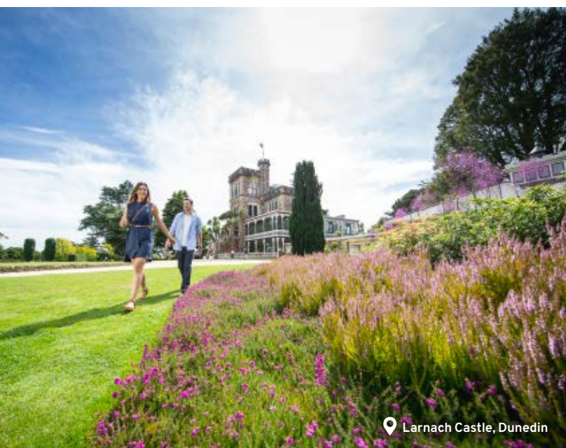
📍 Larnach Castle, Dunedin