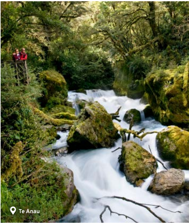
📍 Te Anau