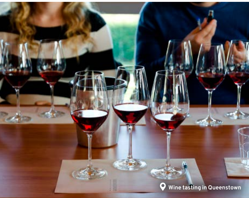
📍 Wine tasting in Queenstown