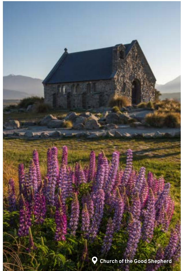
📍 Church of the Good Shepherd