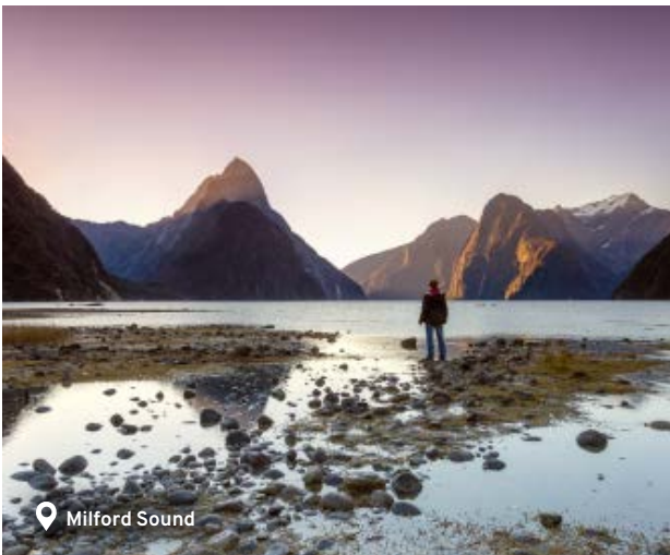
📍 Milford Sound