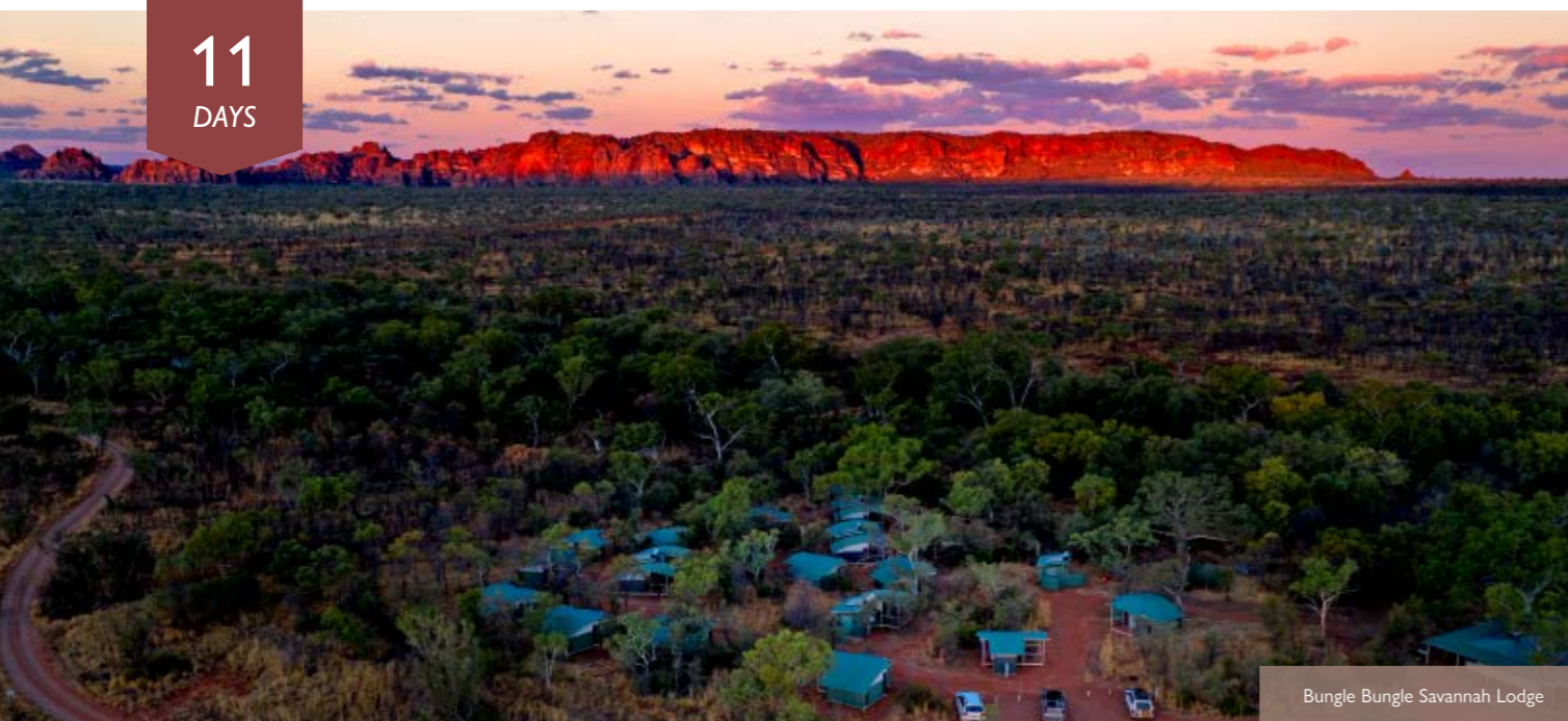
Bungle Bungle Savannah Lodge