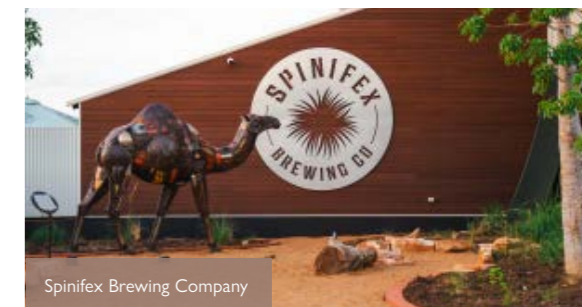
Spinifex Brewing Company