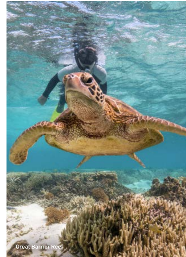
Great Barrier Reef