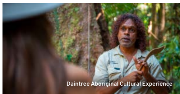
Daintree Aboriginal Cultural Experience