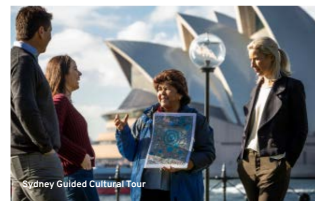
Sydney Guided Cultural Tour