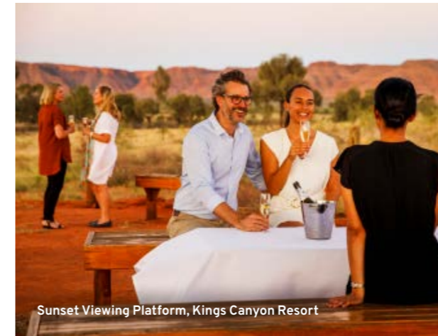
Sunset Viewing Platform, Kings Canyon Resort