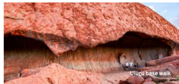
Uluru base walk