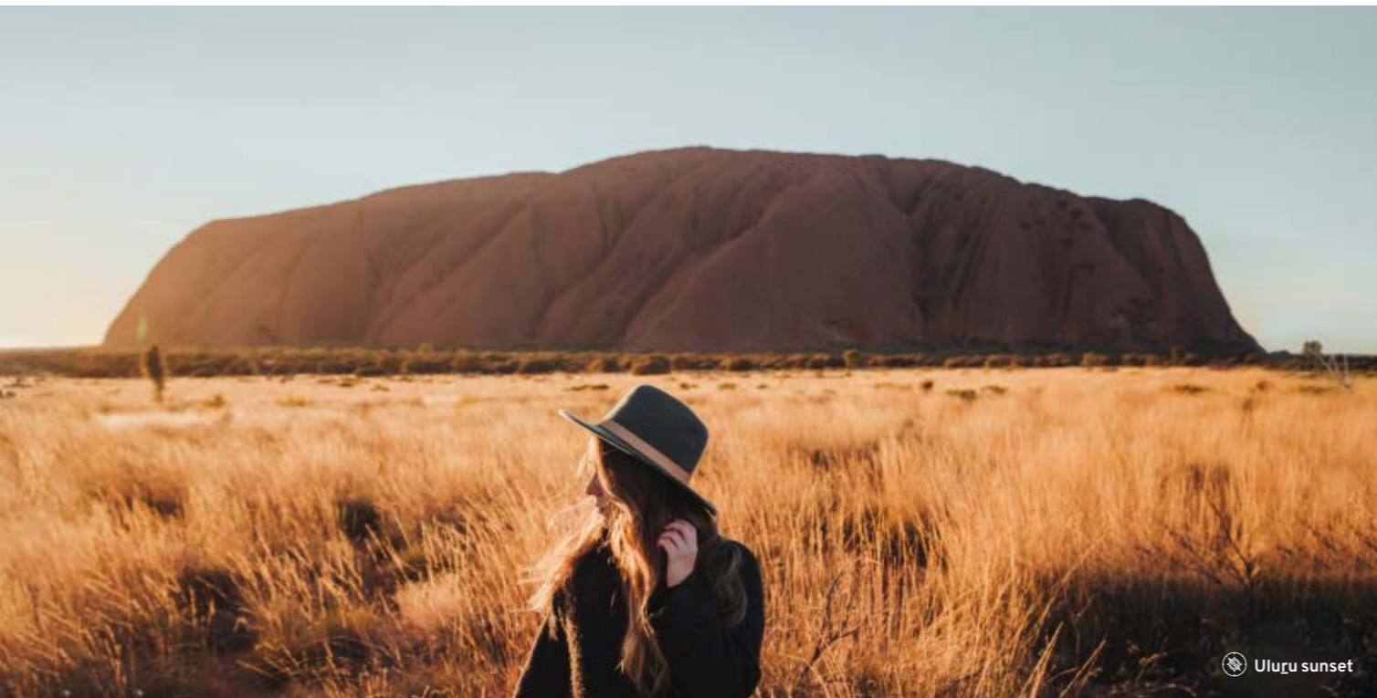
📍 Uluru sunset