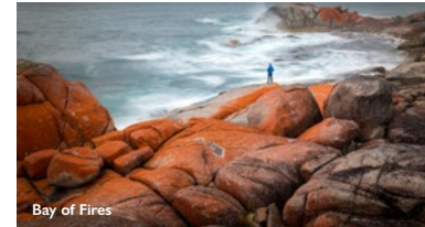
Bay of Fires

HOTEL Peppers Silo Hotel (River Room), 2 nights MEALS Breakfast, lunch