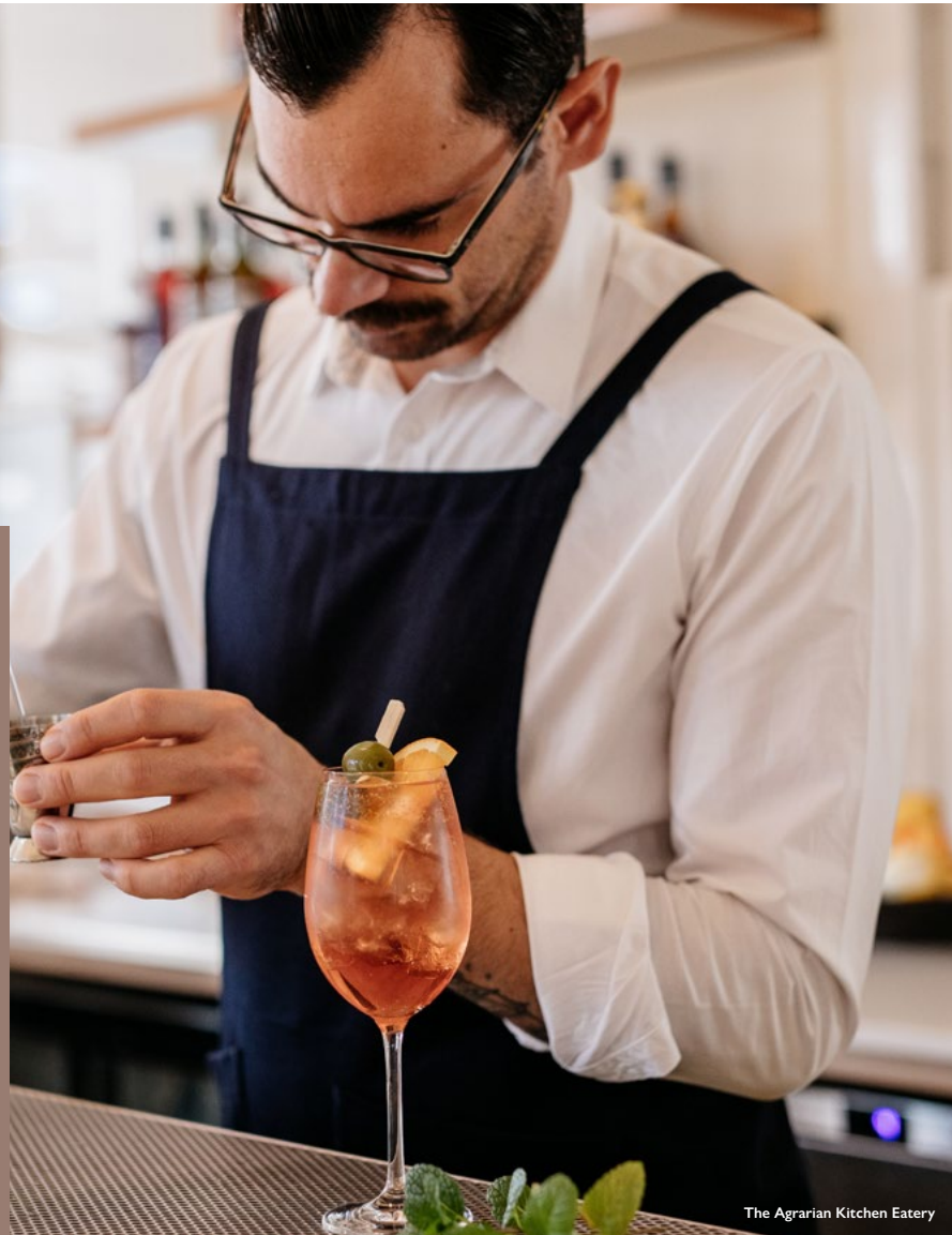
The Agrarian Kitchen Eatery

Unwind at Peppers Silo Hotel on the idyllic Tamar River, and enjoy a relaxing night by the sea on Tassie's tranquil east coast.