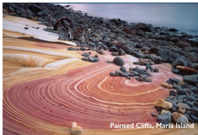
Painted Cliffs, Maria Island

HOTEL Crowne Plaza, 2 nights MEALS Lunch with wine