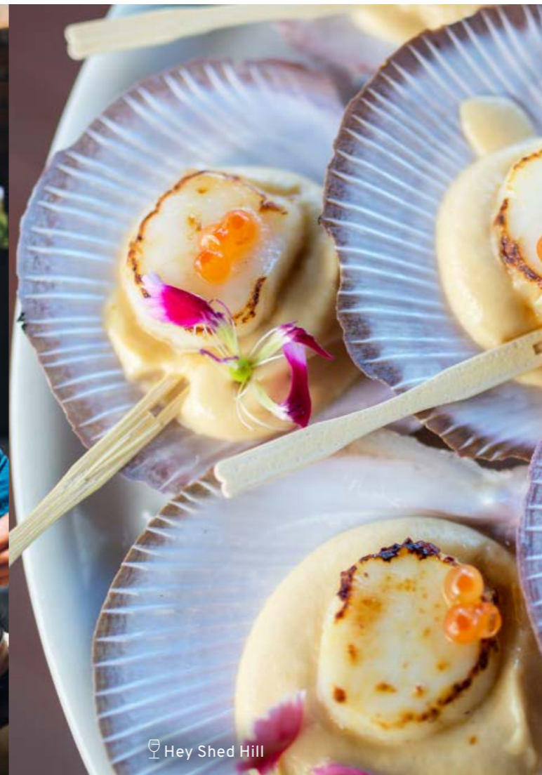
🍷 Hey Shed Hill