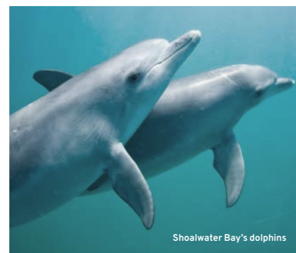
Shoalwater Bay's dolphins