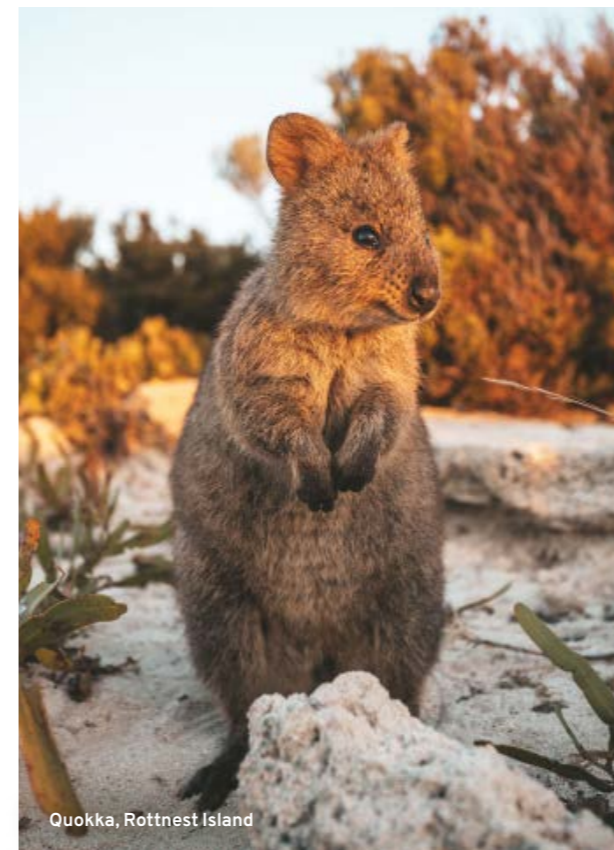
Quokka, Rottnest Island