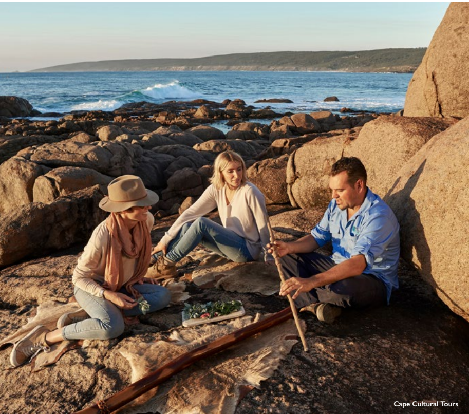
Cape Cultural Tours