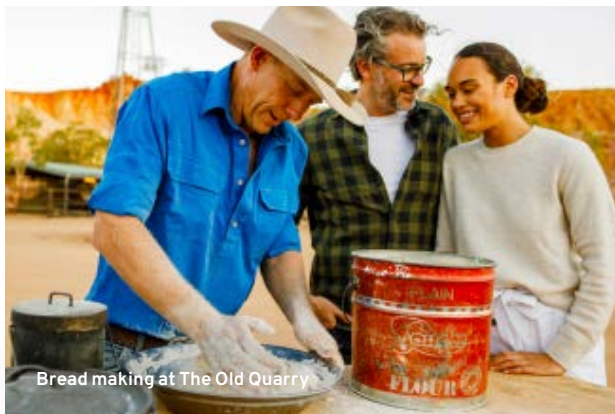
Bread making at The Old Quarry

🍷🍴 Breakfast, lunch, Local Dining Experience