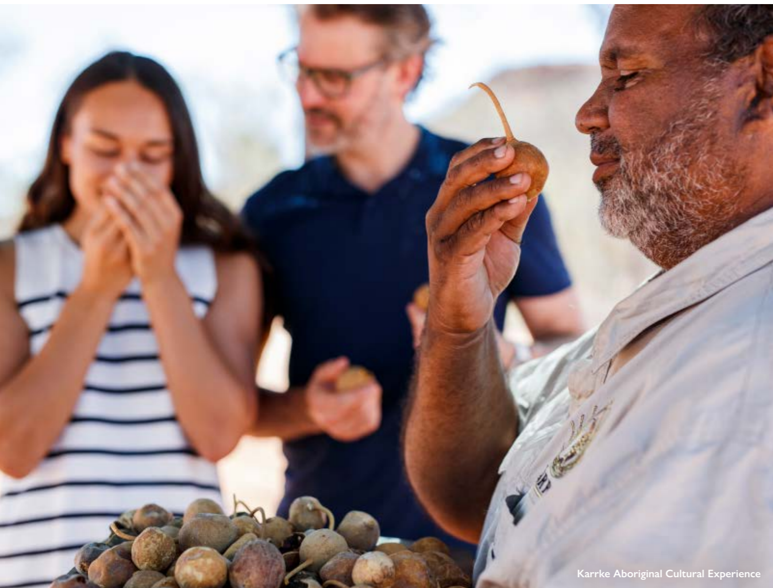
Karrke Aboriginal Cultural Experience

As this journey departs from Hilton Darwin at 7.30am, accommodation will need to be pre-booked for the previous night.