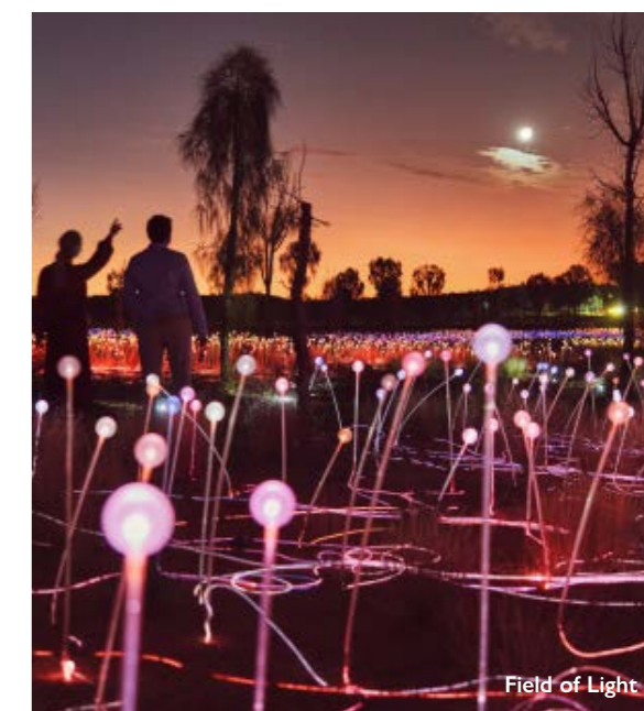
Field of Light