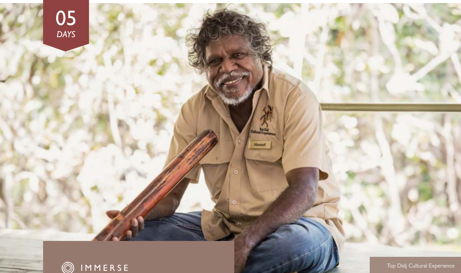
Top Didj Cultural Experience