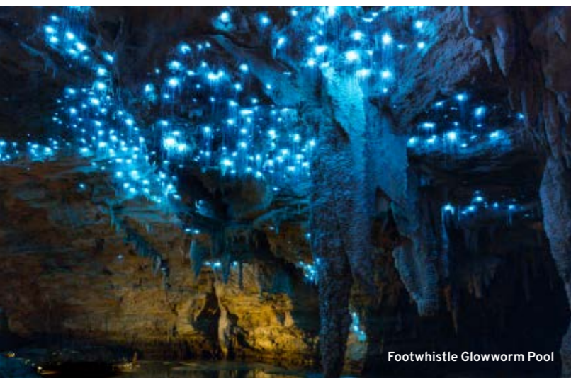
Footwhistle Glowworm Pool

Three times longer than Milford Sound and only accessible by boat, board the Patea Explorer for a cruise across the picturesque Lake Manapouri while keeping a lookout for the rare Fiordland crested penguin.