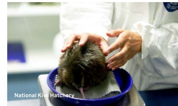
National Kiwi Hatchery