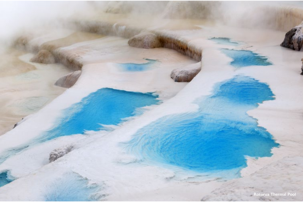
Rotorua Thermal Pool