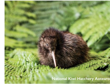
National Kiwi Hatchery Aotearoa