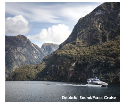
Doubtful Sound/Patea Cruise