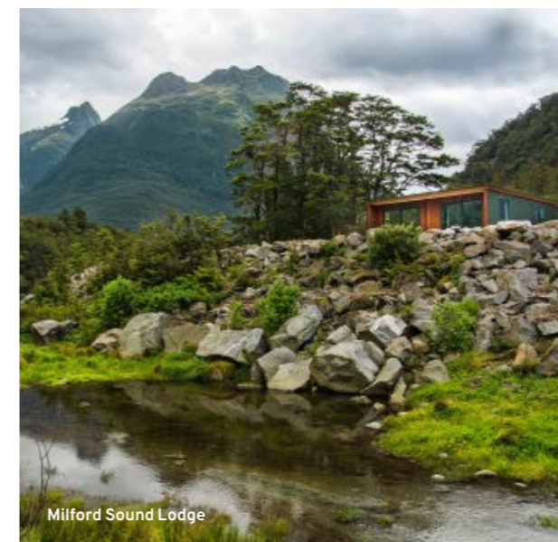
Milford Sound Lodge