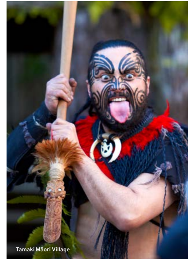
Tamaki Māori Village