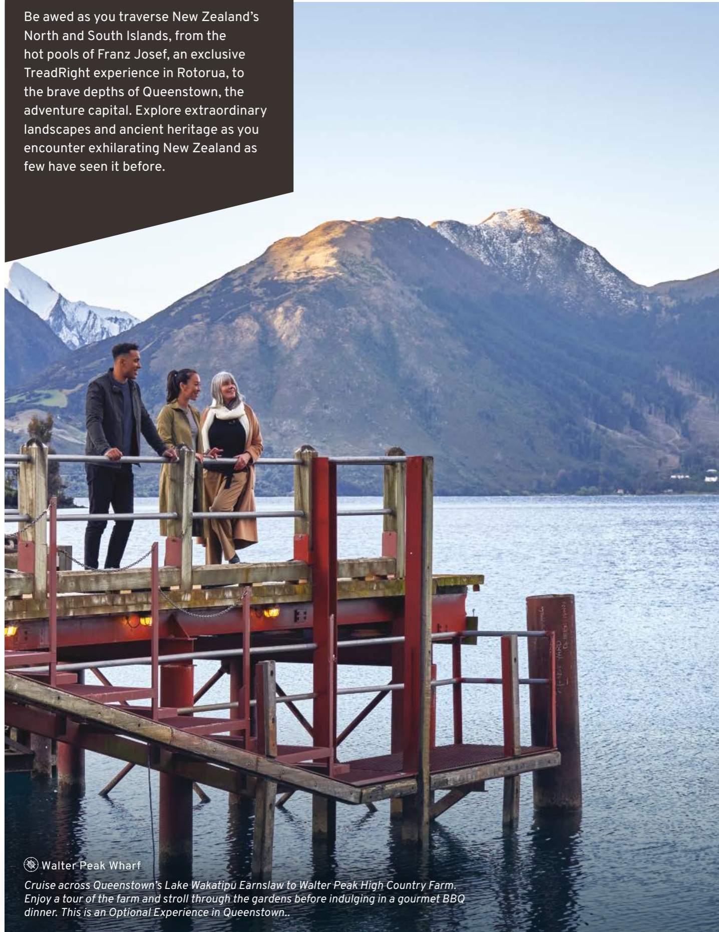
📍 Walter Peak Wharf

Be awed as you traverse New Zealand's North and South Islands, from the hot pools of Franz Josef, an exclusive TreadRight experience in Rotorua, to the brave depths of Queenstown, the adventure capital. Explore extraordinary landscapes and ancient heritage as you encounter exhilarating New Zealand as few have seen it before.