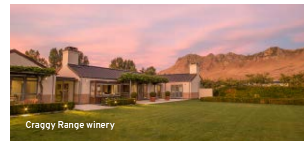
Craggy Range winery