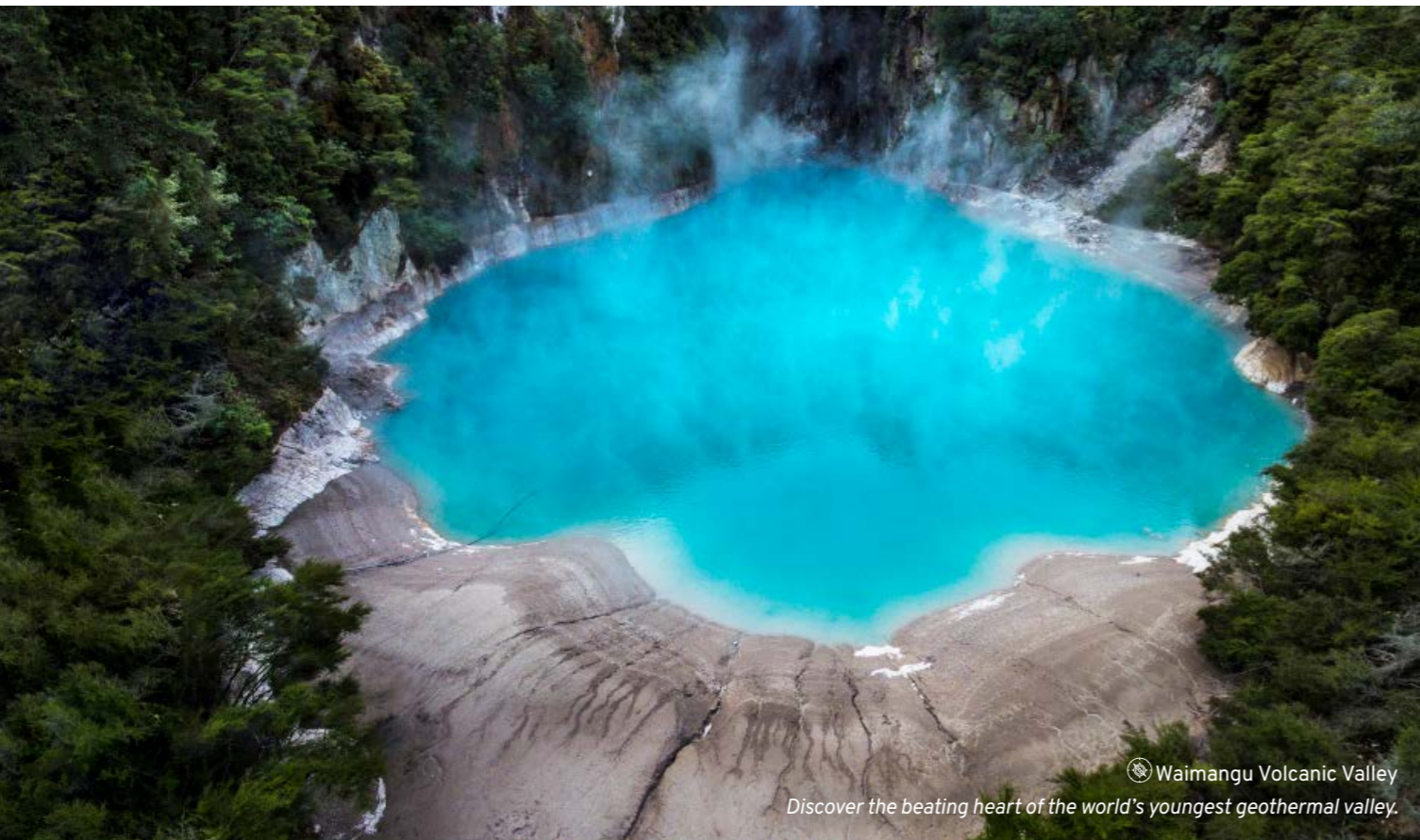
📍 Waimangu Volcanic Valley Discover the beating heart of the world's youngest geothermal valley.