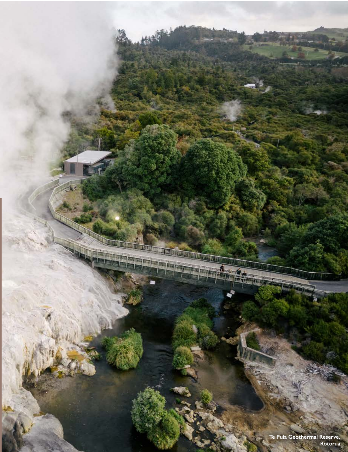
Te Puia Geothermal Reserve, Rotorua