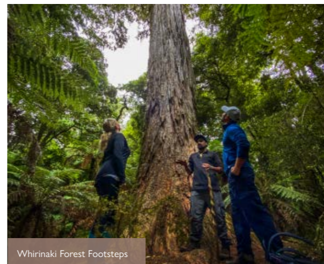
Whirinaki Forest Footsteps