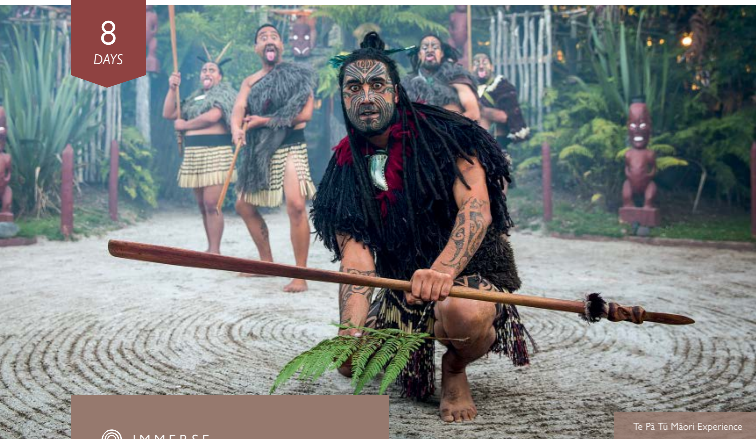
Te Pā Tū Māori Experience