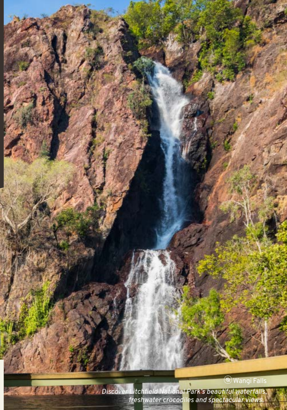
📍 Wangi Falls

Stay in the heart of Nitmiluk National Park at the eco-friendly Cicada Lodge, where you can enjoy sunset drinks and canapes poolside looking out to the native bushland.