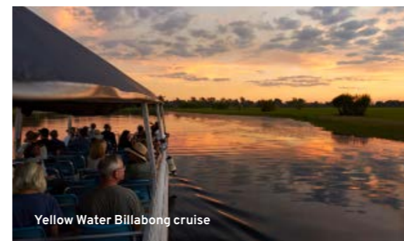
Yellow Water Billabong cruise